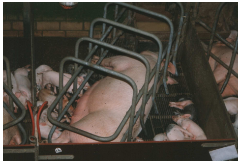
Sow with Piglets in farrowing stall