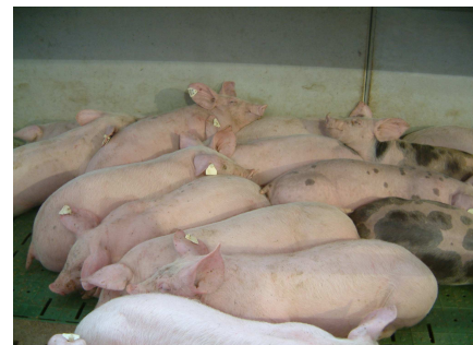
Pigs for fattening